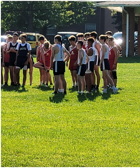
Boys cross-team getting ready at their home course before the gun goes off.