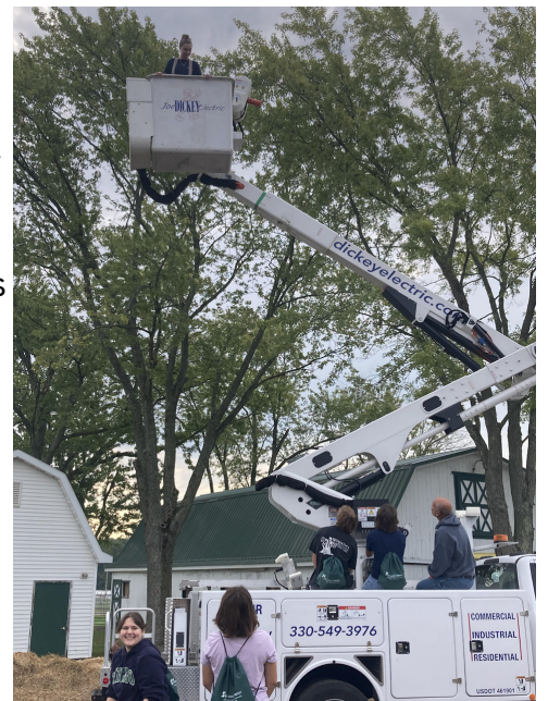
Juniors had many hands-on experiences, including operating a bucket truck